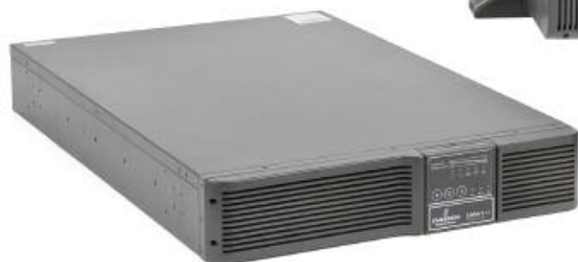
PSI XR 2U Rack version